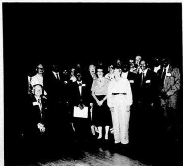
1996 GENERAL AND JURISDICTIONAL CONFERENCE DELEGATES AND RESERVES