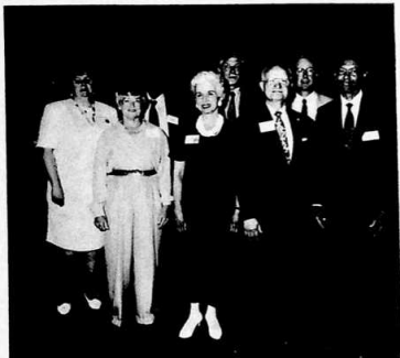
1996 GENERAL CONFERENCE DELEGATES