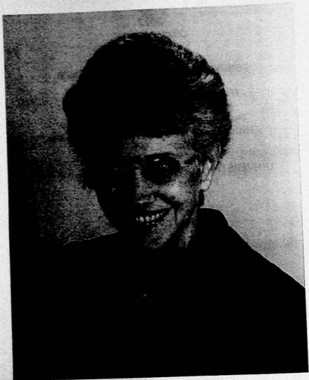
BISHOP PEGGY JOHNSON PHILADELPHIA EPISCOPAL AREA THE UNITED METHODIST CHURCH