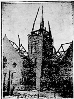
A Burning Shame!

Nobody knows when Fire or Lightning or Wind Storm will rage and destroy. Somewhere every day church or home property is burning.