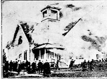
A Burning Shame!

Nobody knows when Fire or Lightning or Wind Storm will rage and destroy. Somewhere every day church or home property is burning.