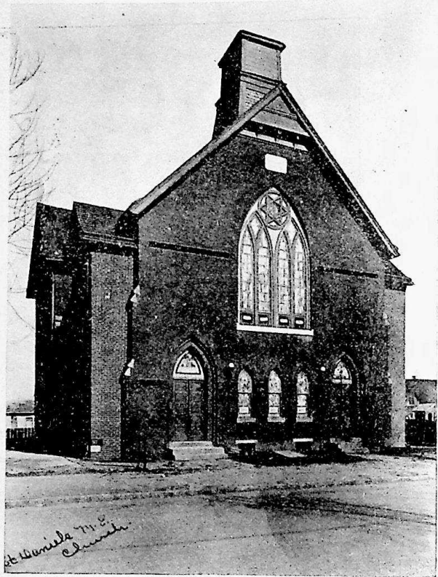
ST. DANIEL'S M. E. CHURCH, Chester, Pa. The Seat of the 63rd Session of the Delaware Annual Conference