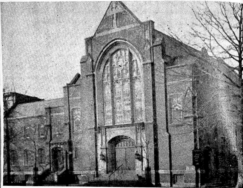
NEWMAN MEMORIAL METHODIST CHURCH BROOKLYN, NEW YORK

WHERE THE EIGHTY-FOURTH SESSION OF THE DELAWARE CONFERENCE OF THE METHODIST CHURCH WAS HELD.